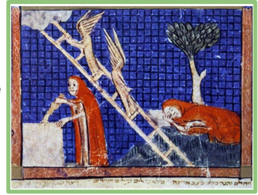
Unknown artist--Sarajevo Haggadah: Jacob's Dream, c. 1350