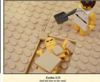
Exodus 2:12 And hid him in the sand.