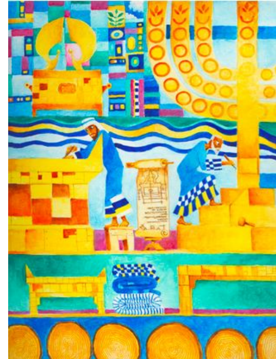
Vayakhel By Darius Gilmont

By the end of Vayakhel they have built the tent to go over the אֹתֶנֶן as well as the screen for the entrance to the אֹתֶנֶן , the ark, the kruvim --which some people translate it as angels--that sit on top of its cover, the bread table, the seven-branched menorah and the copper washbowl and stand.